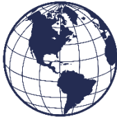
50 million people worldwide are in modern slavery

This statement is made as part of The Company’s commitment to eliminating the exploitation of people under the Modern Slavery Act 2015. It summarises how The Company operates, the policies and processes in place to minimise the possibility of any problems, any risks we have identified, how we monitor them, and how we train our staff.