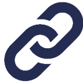
28 million are in forced labour